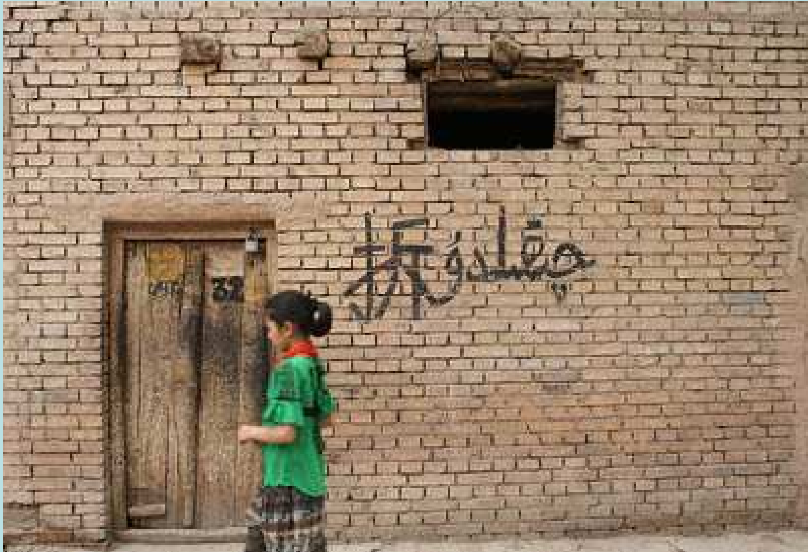
Slide 5 - ©Lauren, Abandon the Cube