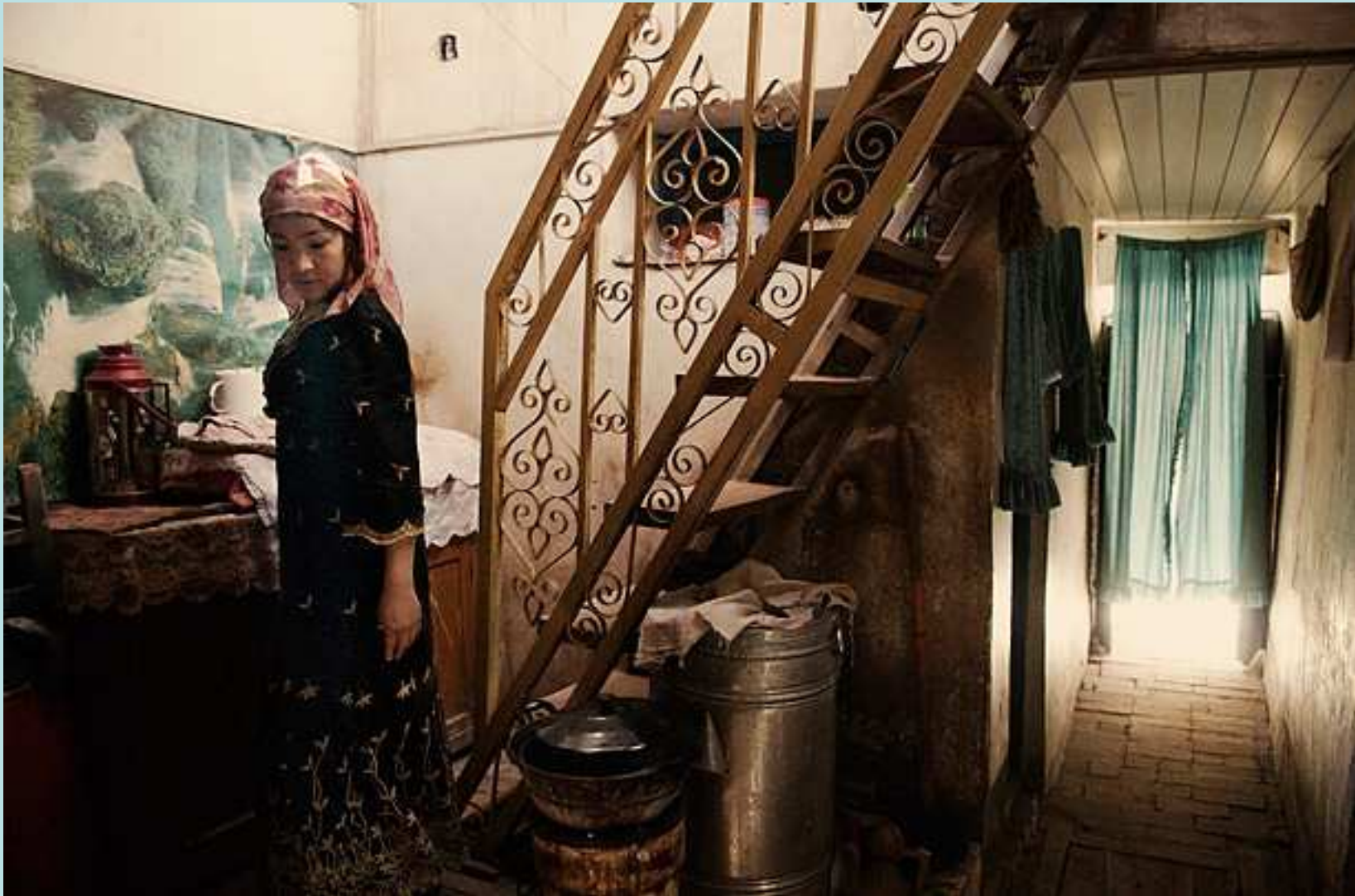
Slide 9 - ©Gilles Sabrie, Time