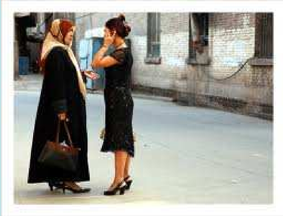
Slide 13 - ©Caleb Colman