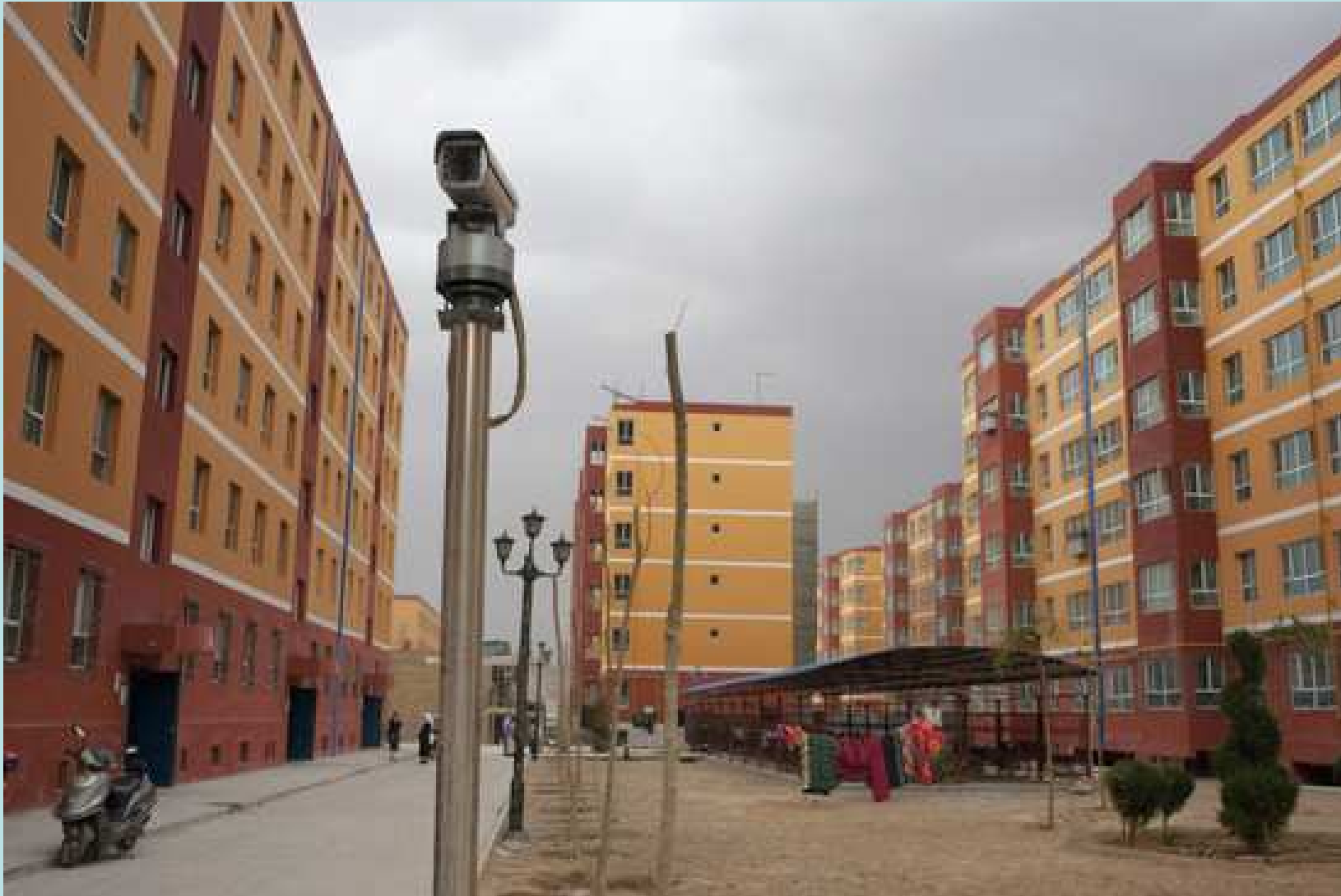
Slide 14