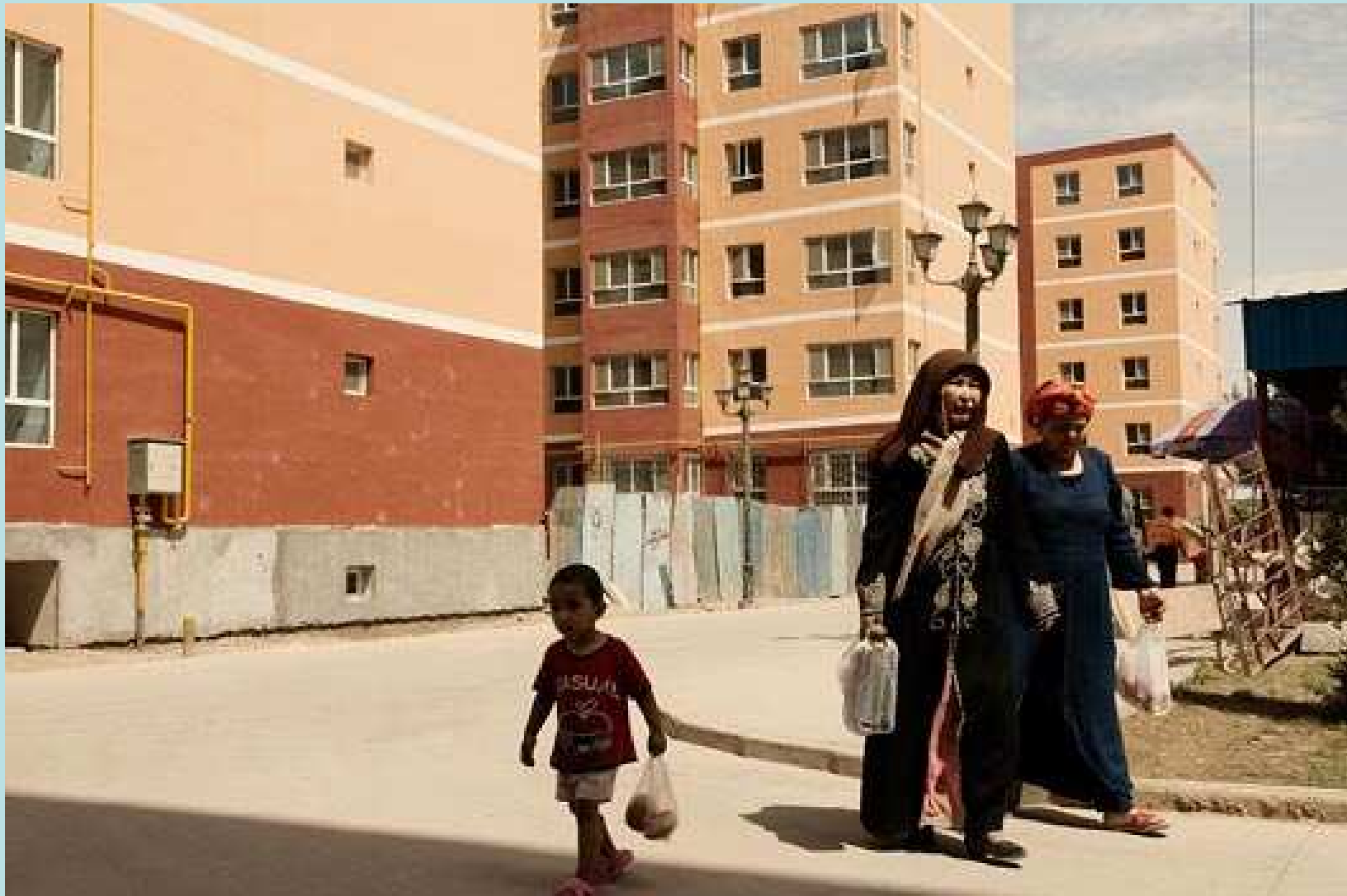
Slide 7