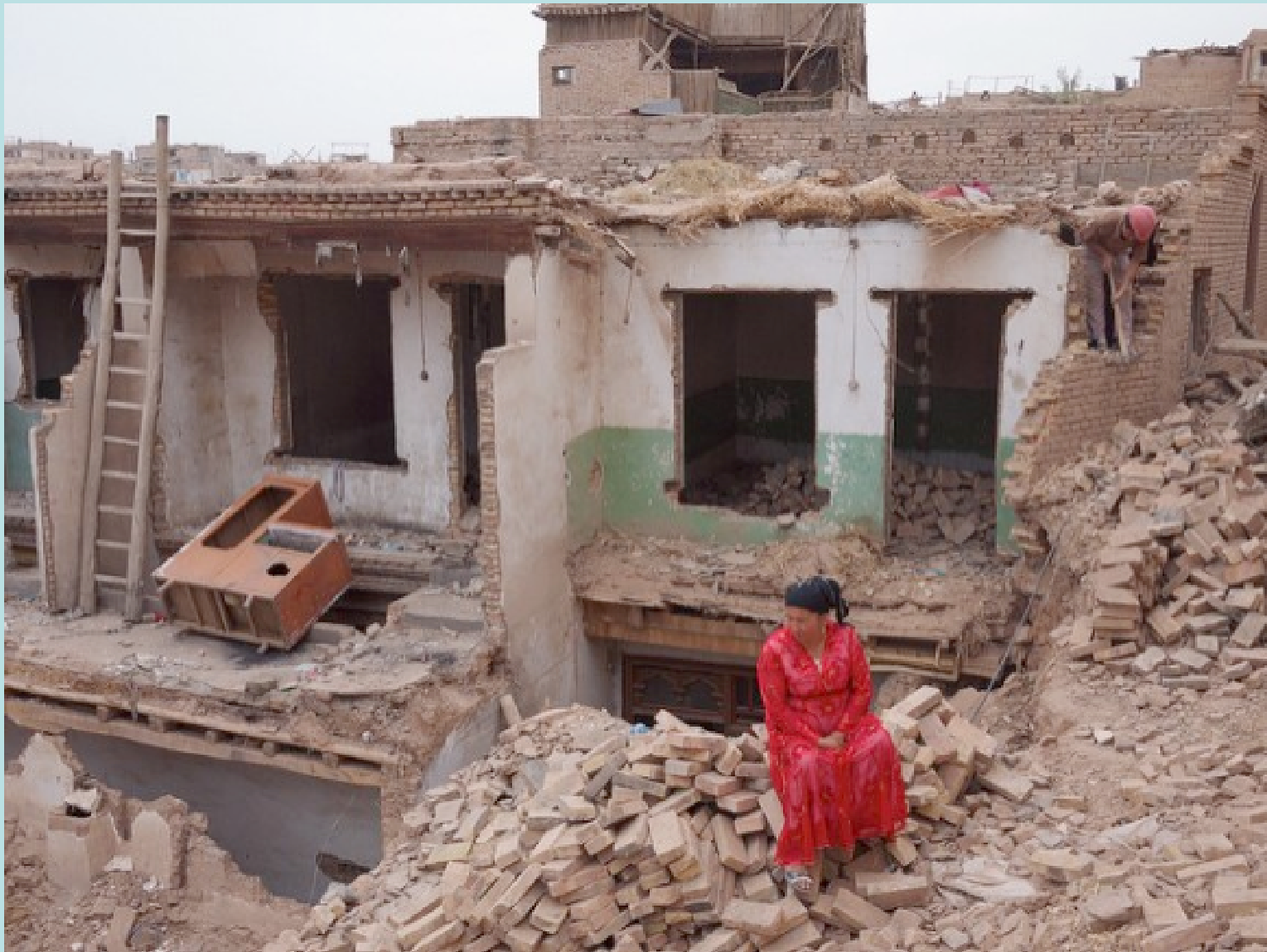
Slide 10