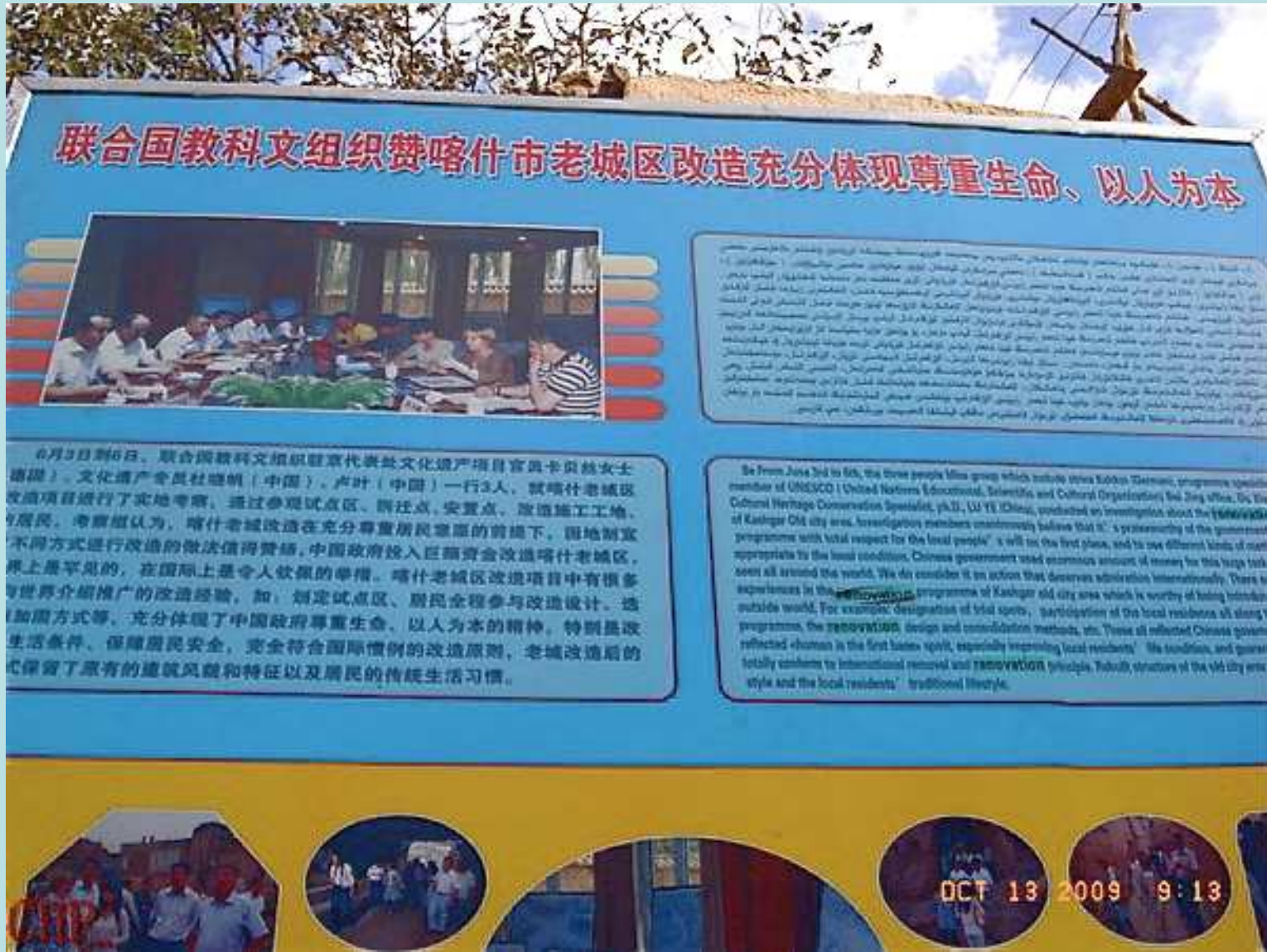
Slide 11- “UNESCO commends Kashgar Old City’s reconstruction as completely respecting people’s lives”