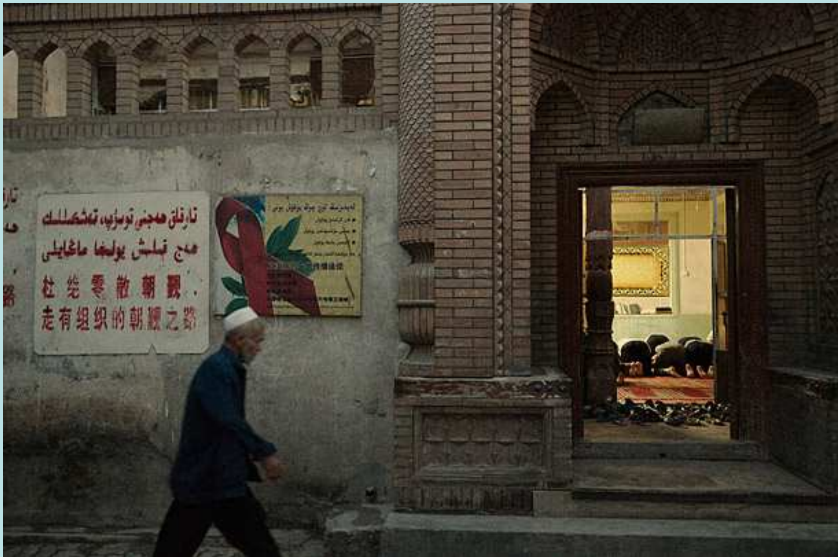
Slide 4