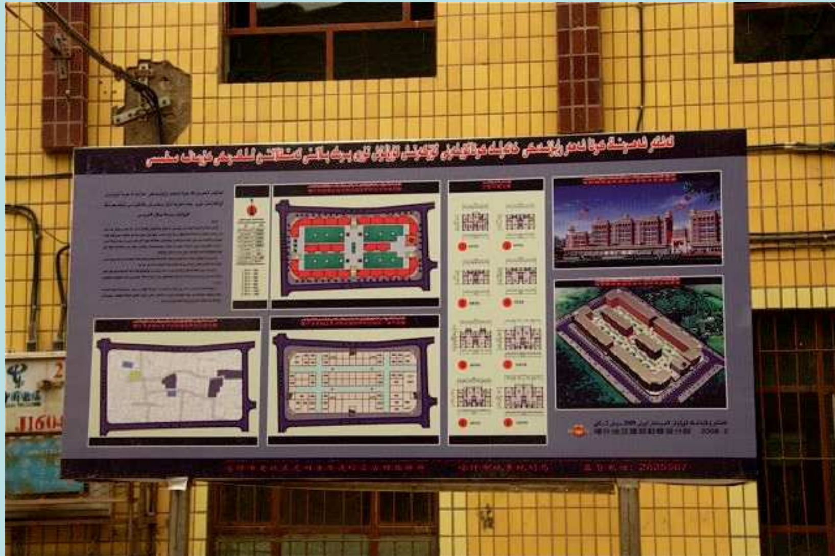
Slide 6 - "Reconstruction Plan for Hazardous Housing in Kashgar's Old Town, Chasa Street"