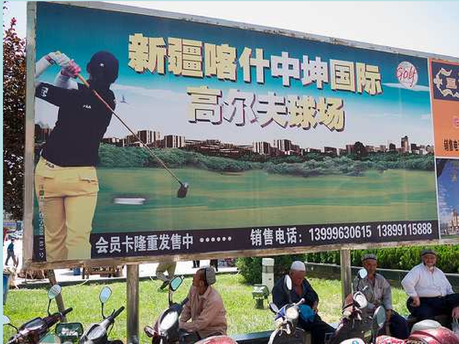
Slide 15 - ©Stefan Geens, Ogle Earth