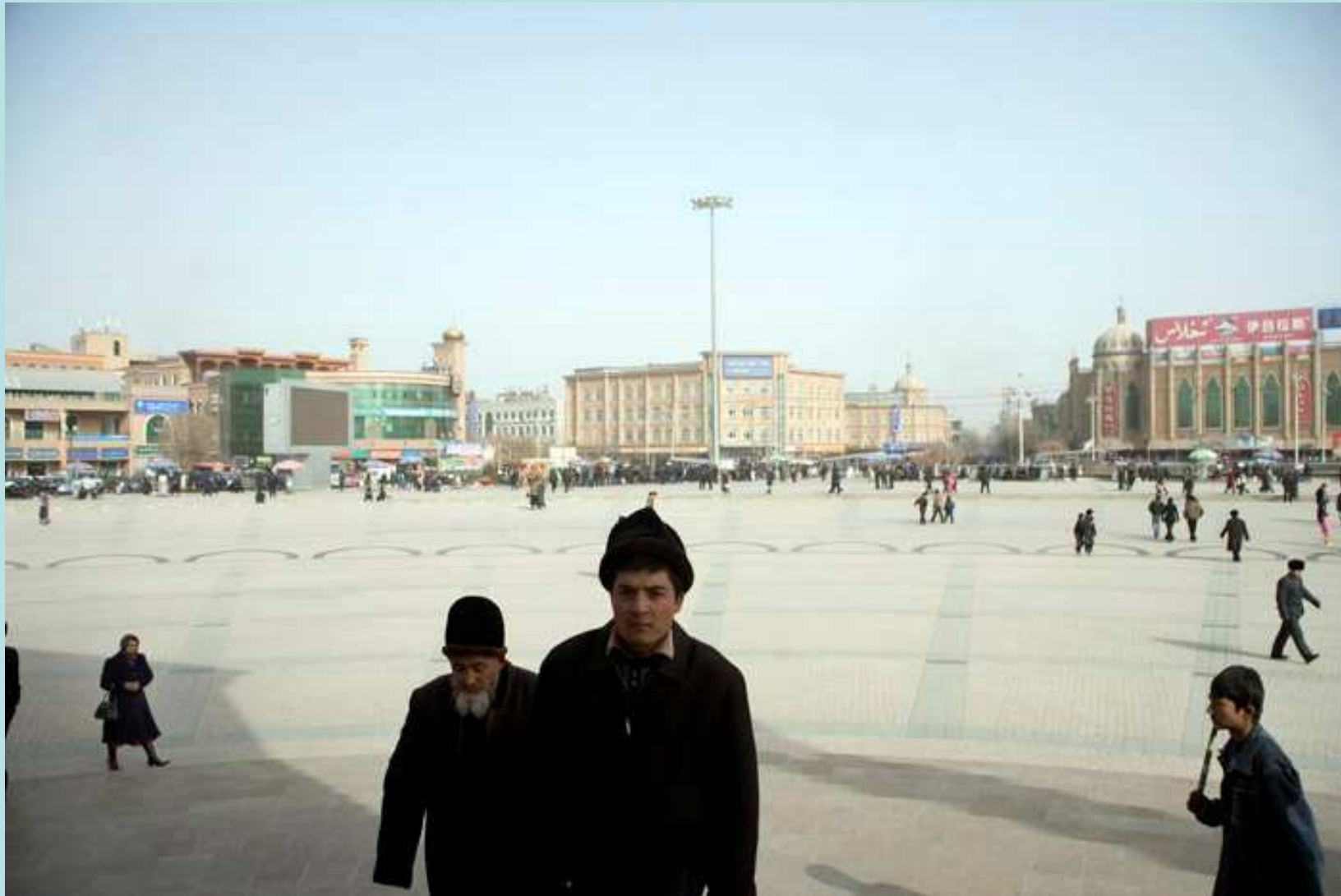
Slide 17